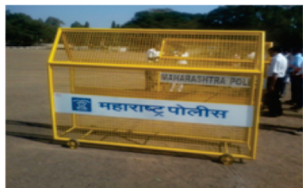
Moveable Barricades for Maharashtra Police