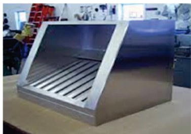
Stainless steel Fabrication