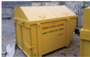
Filth Box for Nagar Parishad