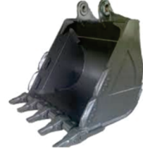
Bucket for Backhoe Loader